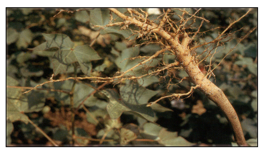
Figure 6. Galls on roots caused by root knot nematode.