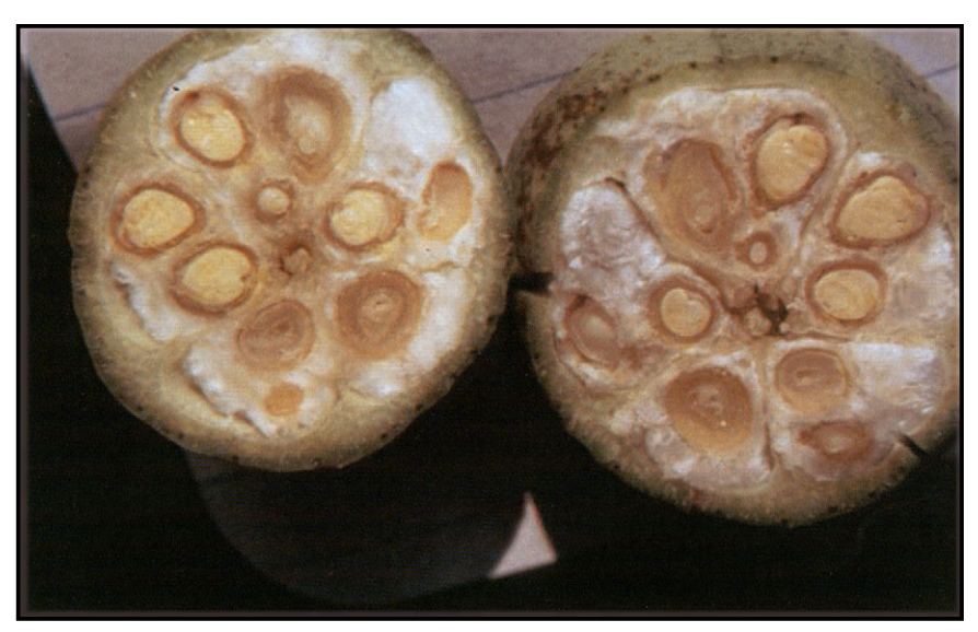
Figure 5. In some South Carolina fields seeds rotted in bolls.