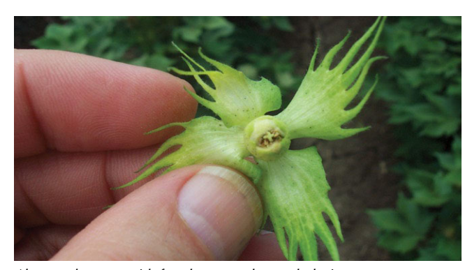
Abnormal square with four bracts and extruded stigma.

When the meristem is producing carpels, the number of locks is determined. Whether an upland boll produces a four-or five-lock boll, is influenced by the health of the plant. If ample supply of carbohydrates is available (usually just before and after early bloom), the microscopic squares will produce more five-lock bolls. Plant health is usually reduced early in the square period (from cool temperatures) and from mid to late bloom (heavy boll load), and thus squares initiated at this time result in a higher proportion of four-lock bolls.