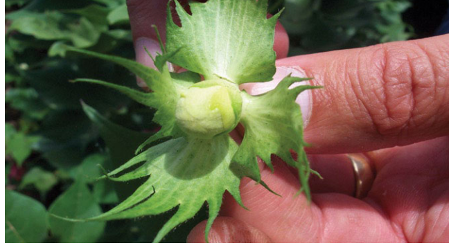
Abnormal square with four bracts.

lowest fruiting branches appear most susceptible to four-bract squares, because high temperatures later in the season do not have the same effect. Four-bract squares are more susceptible to shed and thrips injury. The fourth bract provides an opening for thrips to enter the young square.