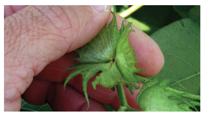
Abnormal square containing only bracts.

After the fruiting branch meristem forms the subtending leaf, it starts to form the bracts. High spring temperatures (average day/night temperature above 80°F) can cause this meristem to attempt to produce another leaf after the subtending leaf, but before the bracts are formed. This extra leaf forms a fourth "bract", and is located just outside the normal three bracts. The