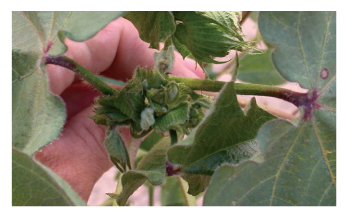
Terminal of a deficit moisture stressed plant exhibiting large squares in the terminal at first flower.

Another event that occurs approximately 22 days prior to bloom is the formation of ovules. When plants experience stress (cold or hot temperatures), the number of ovules per lock in pinhead squares is reduced. Although by 22 days prior to bloom the upper limit of seeds per boll has already been set (locks per boll X ovules per lock), up to half of the ovules fail to develop into a seed and terminate development as a mote.