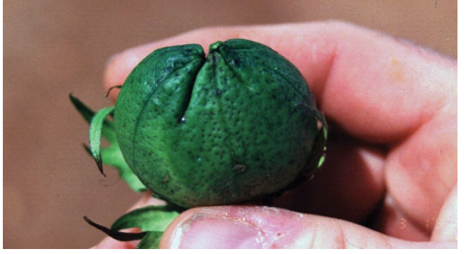
Supernumerary carpel boll.