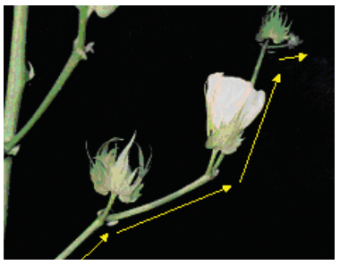
A cotton fruiting branch.

produced in a set order; first the subtending leaf, then the bracts, sepals, petals, anthers and finally the carpels (immature locks). The last formation of a fruiting branch meristem is the carpels. Further growth of the fruiting branch requires another meristem to grow, which is located at the base of