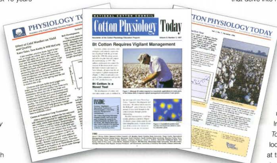
Progression of newsletters.