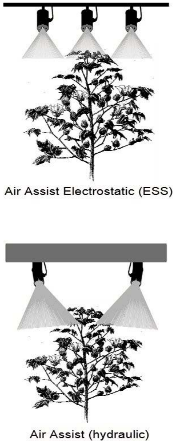
Fig. 2. Sprayer nozzle arrangement and spray direction for the air-assisted sprayers.