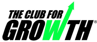
Club for Growth