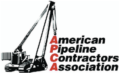
American Pipeline Contractors Association