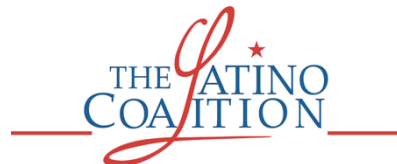
The Latino Coalition