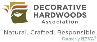
Decorative Hardwoods Association