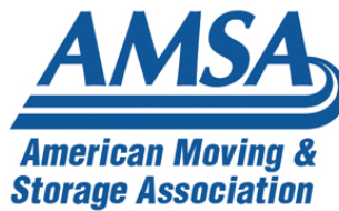
American Moving & Storage Association