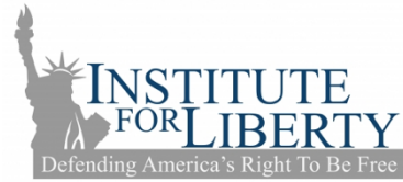
Institute For Liberty