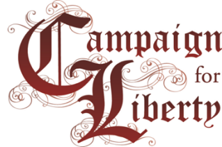
Campaign for Liberty