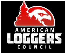
American Loggers Council