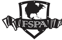
Financial & Security Products Association