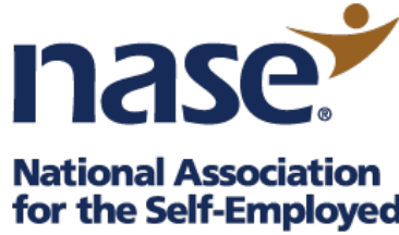
National Association for the Self-Employed