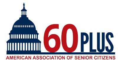
60 Plus Association