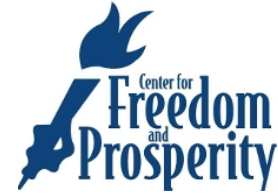
Center for Freedom and Prosperity