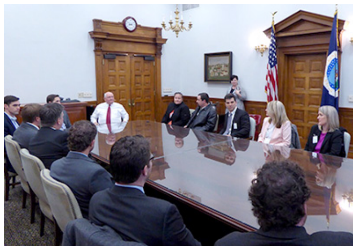
The Emerging Leaders Program participants met with lawmakers, their staffers and key government agency officials during their visit to Washington, DC.