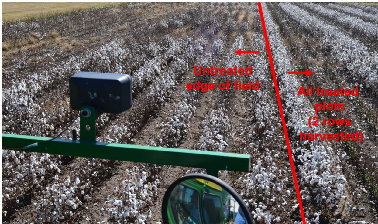
Figure 3. Kiowa County irrigated trial at harvest, Nov 1.