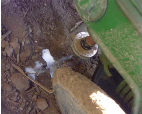
Figure 1. Application method of Topguard® by spray nozzle mounted on the planting unit behind the disc openers and in front of closing wheels.

representatives were received. Producer surveys are being conducted to better determine producer use and the agronomic and economic impact.