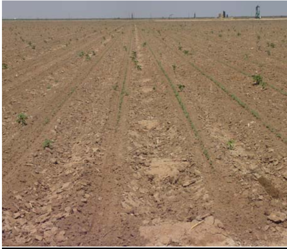
Figure 5. Slightly smaller cotton seedlings observed in Topguard® treated rows, left as compared with rows on the right