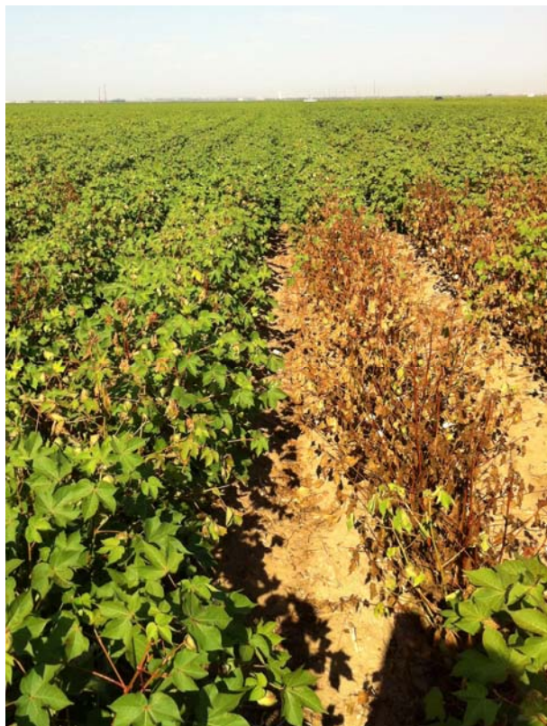
Figure 3. Comparison of Topguard® treated rows, right, and untreated rows, left in a subsurface drip irrigated field near San Angelo, TX during the 2012 growing season.