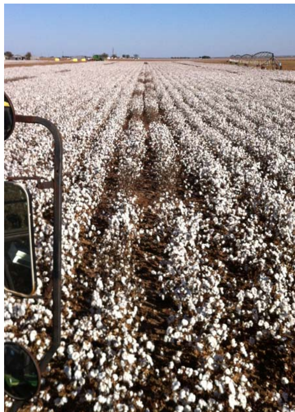
Figure 4. Pattern of Cotton Root Rot diseased plants from areas untreated with Topguard® due to a sprayer malfunction in a pivot irrigated field near San Angelo, TX during the 2012 growing season.