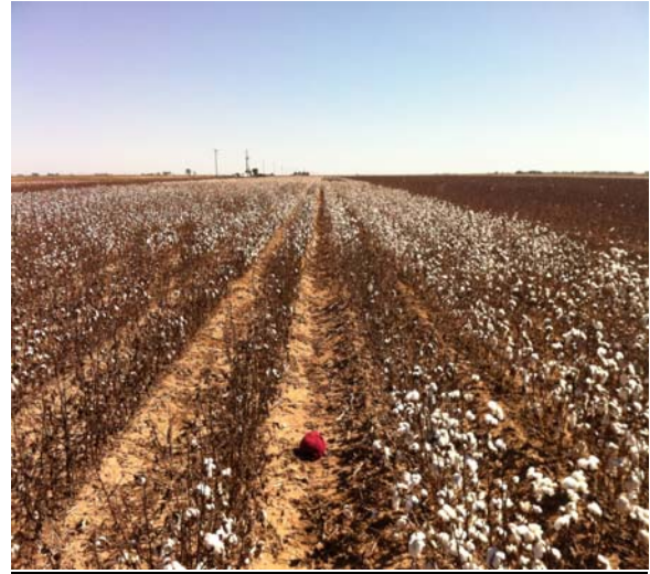
Figure 6. High disease incidence in rows on the right side despite treatment with 32 fl. oz per acre of Topguard®

Planned untreated control areas in multiple locations provided valuable comparisons and insights into areas for additional research and refinement. Delayed seedling emergence was observed in some locations where there was high soil moisture at the time of or shortly after planting (Figure 5). These conditions were created by excessive irrigation before planting, rainfall or overhead irrigation within a day or two of planting. In most cases there were other complicating conditions that did not favor seedling emergence including high salinity, high temperatures, high winds, deep planting depth, and soil compaction or crusting. Although emergence and seedling establishment was delayed in most cases other yield limiting differences later in the season did not develop. There were some instances of replanting especially where there were multiple stress factors.