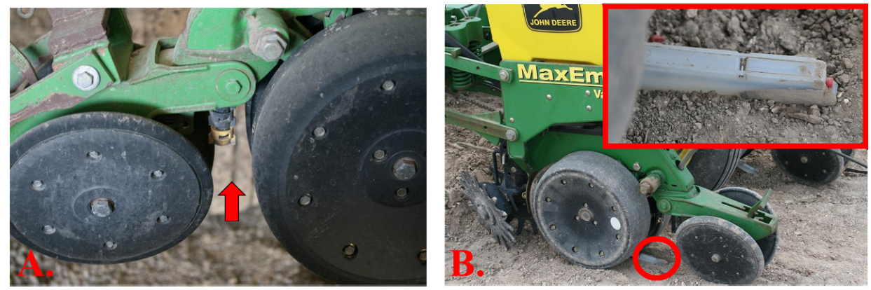
Figure 1. Application at planting. A. Placement of nozzle for T-band application (arrow). B. Nutramark seed bed firmer used for in-furrow application (circled and detail).

A TeeJet DG 80015 VS tip, oriented perpendicular to the open furrow (Fig. 1a), applied the fungicide in a volume of 4 GPA. This treated the furrow around the seed, as well as the sides of the furrow, but the seed was not directly sprayed with fungicide.