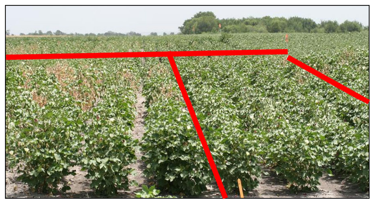
Figure 2. Hill County experiment on July 3, 2012. In the foreground, a non-treated plot to the left of the red line; a plot treated with 16 fl.oz./A Topguard to the right.

Based on observations from commercial, non-experimental fields, there can be a risk of phytotoxicity if there is a heavy rain within three days of planting. Unfortunately, there were only a few experiments in which there was sufficient disease pressure on all replicates of the controls to make meaningful comparisons on disease incidence and yield. For example, the first replicate of an experiment in Hill County had noticeable disease pressure and a noticeable response to the fungicide (Figure 2), but the disease was not as severe in the controls in some of the other replicates. Dry weather conditions during the growing season were a factor in reduced disease, but even in fields with ample watering, the disease did not appear where it was known to have appeared in previous years.