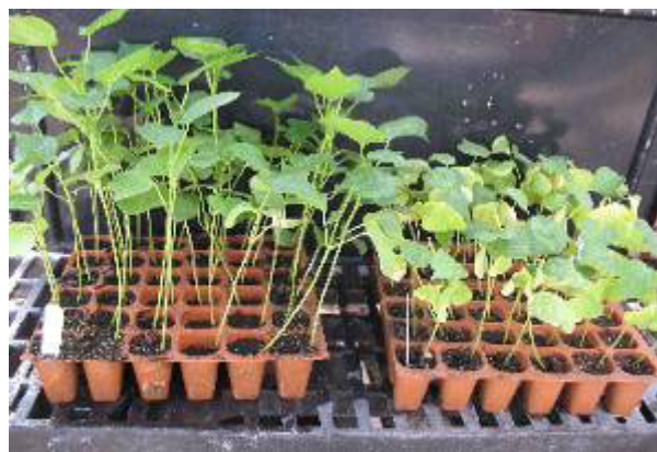
Figure 1. Differences in seedling growth between the control (left) and PEG treatment (right).