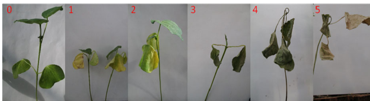
Figure 2. Phenotypes of individual plants after PEG treatment. 0- normal growth; 1- yellowing cotyledons; 2-wilting cotyledons; 3-wilting true leaves; 4- dry plant; 5- dead plant.