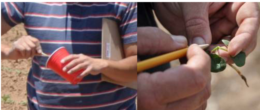
Figure 1. Visual sampling method (left) and cup sampling method (right).

Two sample plans (enumerative and binomial) and two methods (visual and 16oz plastic cup) were evaluated (Figure 1). Individual plants were removed from the soil by gently grasping the cotton stem at the soil line and pulling straight up. Then, the cotton plant was either subjected to the visual or cup sample method. Visual inspection was accomplished using a sharpened pencil to pry apart folded or creased leaf tissue to expose hidden thrips. Adults and nymphs were then counted and recorded. The cup method was employed by inserting the cotton plant into the cup and shaking vigorously for several seconds to dislodge any thrips into the cup. Adult and nymph thrips dislodged into the cup were counted, recorded and discarded.