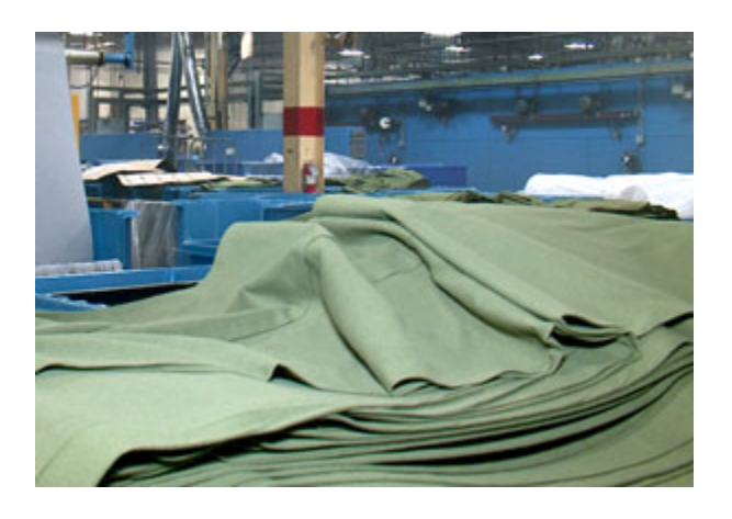
The NCC supported the "Port Transparency Act" because port disruptions cause textile manufacturers to slow down or stop assembly lines making just-in-time inventory like this cotton fabric difficult to manage.

how U.S. ports operate, establish a port performance measurement and reporting program based on sound data, and enable the responsible federal agencies to prepare meaningful annual reports on the performance and capacity of the nation's key ports. The letter noted that when a serious port disruption occurs such as the 2015 West Coast port situation, the effects are far-reaching because: 1) exporters lose customers overseas; 2) perishable products are ruined; 3) manufacturers have to slow down or stop assembly lines because just-in-time inventory becomes impossible to manage; and 4) retail goods are delayed or miss important selling seasons.