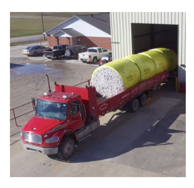
The NCC developed and posted on its website a number of technical documents ranging from seed cotton/lint contamination prevention steps to guidelines on how to properly tie down round modules for transport on flatbed trucks.

The NCC continued as an in-kind supporter of America's Heartland, the award-winning national television series celebrating American agriculture. The series, in its 12th season and aired on public television and the RFD-TV cable and satellite channel, educates consumers about the origins of their food, fuel and fiber. In addition, the NCC continued to participate in <a href="http://www.farmpolicyfacts.org/">http://www.farmpolicyfacts.org/</a>. That and "The Hand That Feeds Us" initiative are committed to ensuring American agriculture's long-term success by facilitating meaningful conversations with legislators and consumers about how food and fiber is produced.