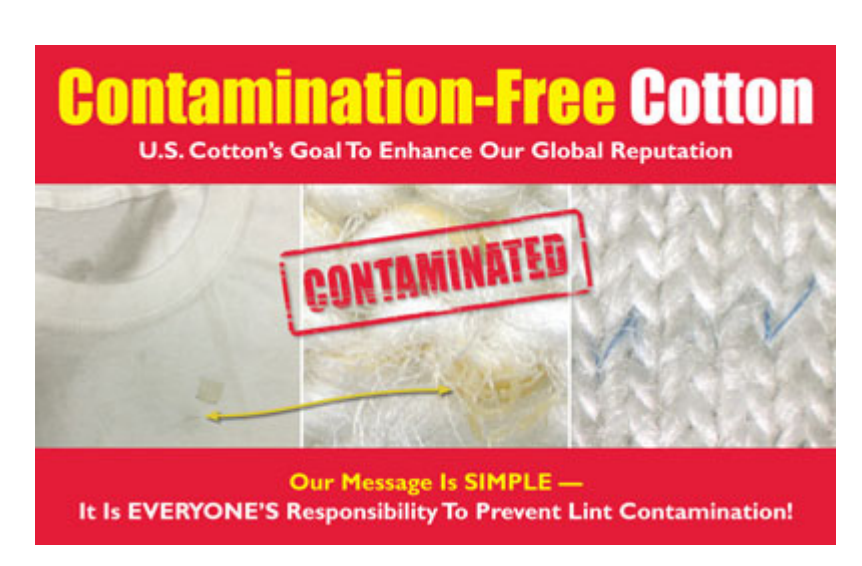
The NCC mailed "Contamination-Free Cotton" flyers to its producer, gin and warehouse leadership – to ensure that growers and all gin employees were aware of their responsibilities in preventing contamination.

A letter from the NCC and other agricultural organizations to EPA asked the agency to provide a separate comment period to determine if justification exists to include a Food Quality Protection Act (FQPA) 10X Safety Factor in the human health risk assessments of all organophosphate chemicals. The letter stated the belief that EPA's plan to use the FQPA 10X Safety Factor in human health risk assessments for all organophosphate chemicals was unnecessary, unreasonable and unwarranted.