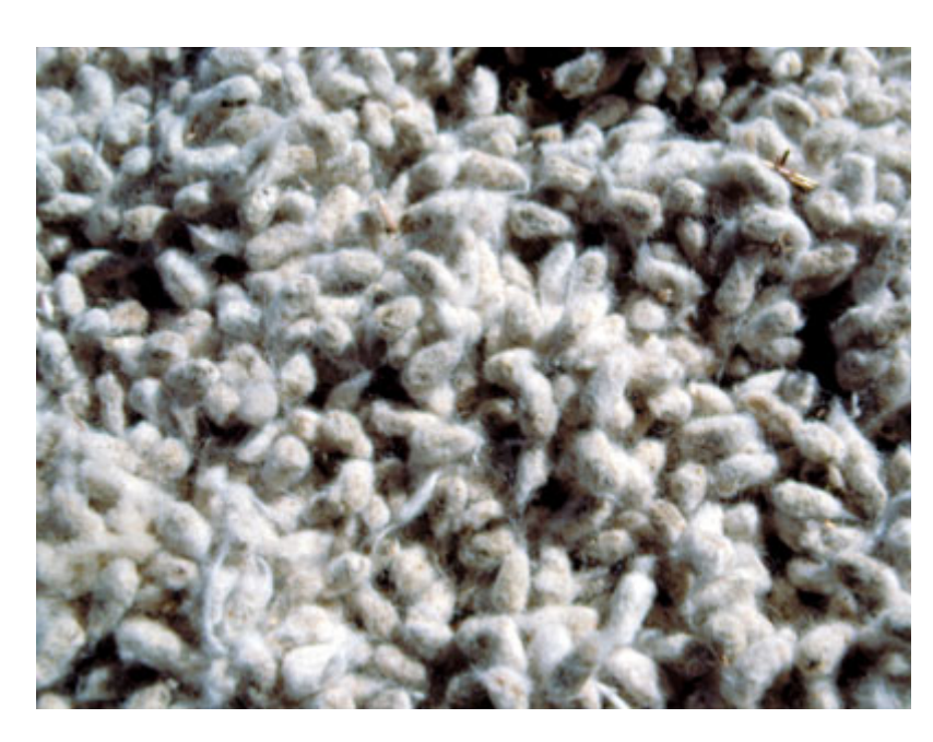
The NCC worked closely with USDA's Risk Management Agency to improve the 2016 crop year's STAX provisions, including that STAX coverage will be available for cottonseed through an optional endorsement.

The NCC also worked closely with USDA on the agency's process to timely inform producers and marketing entities on timely basis of the payment status relative to the payment limit. USDA did announce a new process for