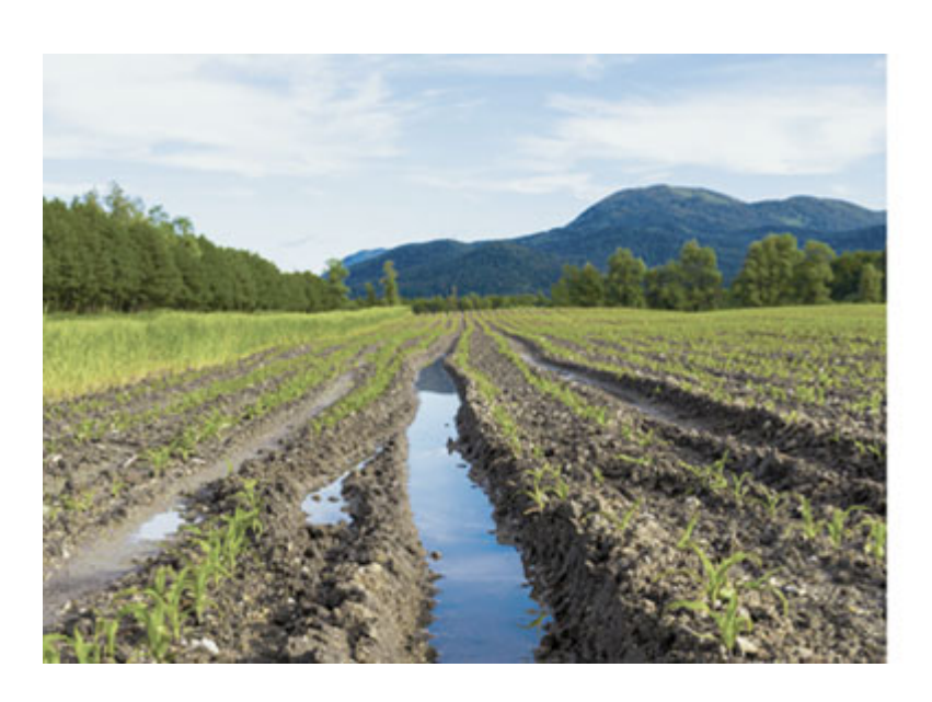
As part of the Waters Advocacy Coalition, the NCC urged Senators to support the Federal Water Quality Protection Act, which included specific definitions of what can and cannot constitute covered waters under the "waters of the U.S." rule.