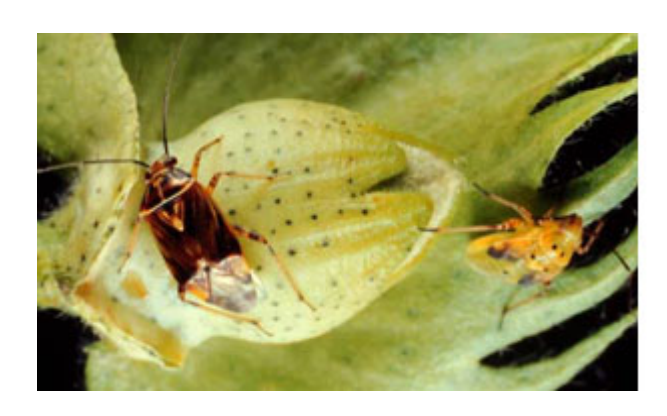
Among Foundation general projects is a study of the impact of weed/insect management on population dynamics and insecticide resistance of the tarnished plant bug.