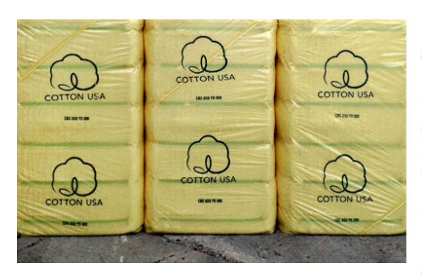
U.S. raw cotton's visibility in the world marketplace is increasing after CCI granted licenses to several U.S. bale packaging firms to imprint the COTTON USA logo on their packaging materials

CCI seized a unique opportunity to increase U.S. raw cotton's visibility in the world marketplace when it granted licenses to several U.S. bale packaging firms to imprint the COTTON USA logo on their packaging materials for use on U.S. bales produced during the 2015-16 season. This initiative was made possible when the National Cotton Council adopted a recommendation from the National Cotton Ginners Association.