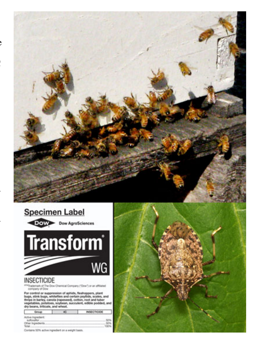
The NCC continued to point out the lack of scientific evidence to support claims against neonicotinoid insecticides linked to honey bee health decline and conveyed concerns about a U.S. Court of Appeals decision that potentially set a precedent jeopardizing the availability of sulfoxaflor and other crop protection products.

The NCC submitted comments to the Fish and Wildlife Service (FWS) opposing the petition to list