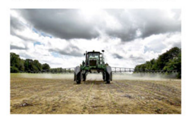
Mississippi farmer Par Woods' 1,989-acre cotton farm near Byhalia, Miss., is running roughly two weeks behind schedule due to rain-saturated fields. In Mississippi, like several other Southern states, the number of cotton farms has reached an all-time low, with the fewest number of acres planted since the Civil War.

Cotton disappearing from Mid-South landscape