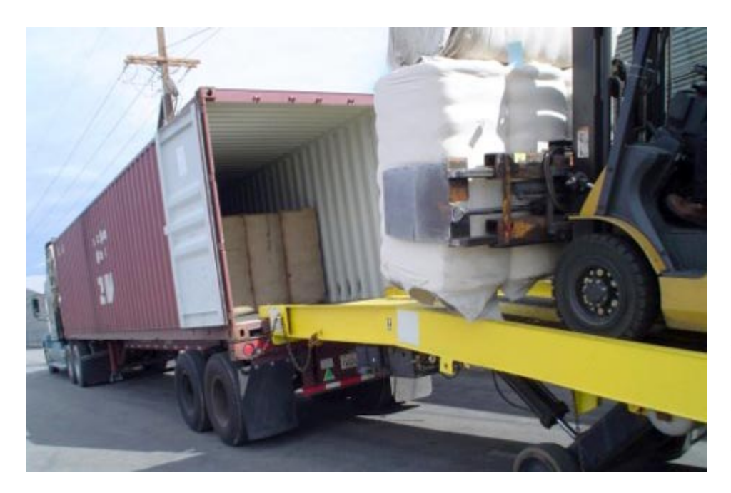
The NCC posted on its web site the "Manager's Guide to Safe Trucking During Agricultural Planting and Harvest Season."

The NCC also arranged for its members to participate in a webinar discussion regarding railroad market power over the U.S. cotton industry. The webinar included a confidential survey that allowed participants to relate their economic impact experience with rail carriers. The NCC, along with other agricultural organizations, pledged to work with Senators Herb Kohl (D-WI) and John Rockefeller (D-WV) to see that comprehensive railroad antitrust legislation was passed in 2009.