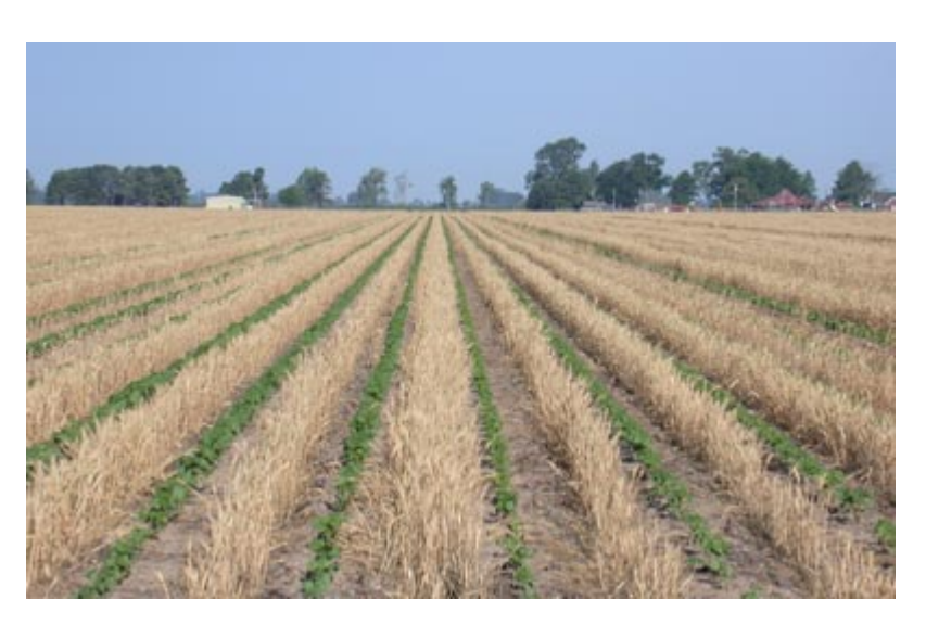
The NCC's Conservation Task Force developed recommendations that were included in the NCC's formal comments on rules pertaining to multiple conservation programs.

The NCC convened its Conservation Task Force (CTF) to review USDA's interim final rules on the Environmental Quality Incentives Program (EQIP), the Wetlands Reserve Program (WRP), the Wildlife Habitat Incentives Program and other 2008 farm law conservation programs. The task force developed recommendations that were included in the NCC's formal comments on these rules. The NCC's comments on EQIP generally focused on proposals regarding irrigation