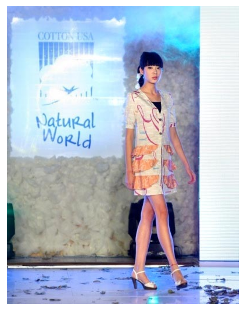
Among key China activities was the COTTON USA "Natural World" promotion that featured Chinese celebrities.

Key activities in China during 2009 included the "COTTON-BEYOND YOUR IMAGINATION" campaign; the COTTON USA "Natural World" promotion includes licensees and celebrities; the U.S. cotton booth at the Intertextile Home trade show in Shanghai; and the China Cotton Association leaders' visit across the U.S. Cotton Belt.