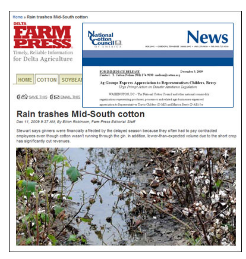
The NCC carried out an extensive communications effort to raise lawmakers' awareness of the Mid-South harvest season catastrophe and of the need for emergency disaster assistance legislation.

A weed resistance management video was produced and is being offered in conjunction with the NCC's Weed Resistance Learning Module on the NCC's website at