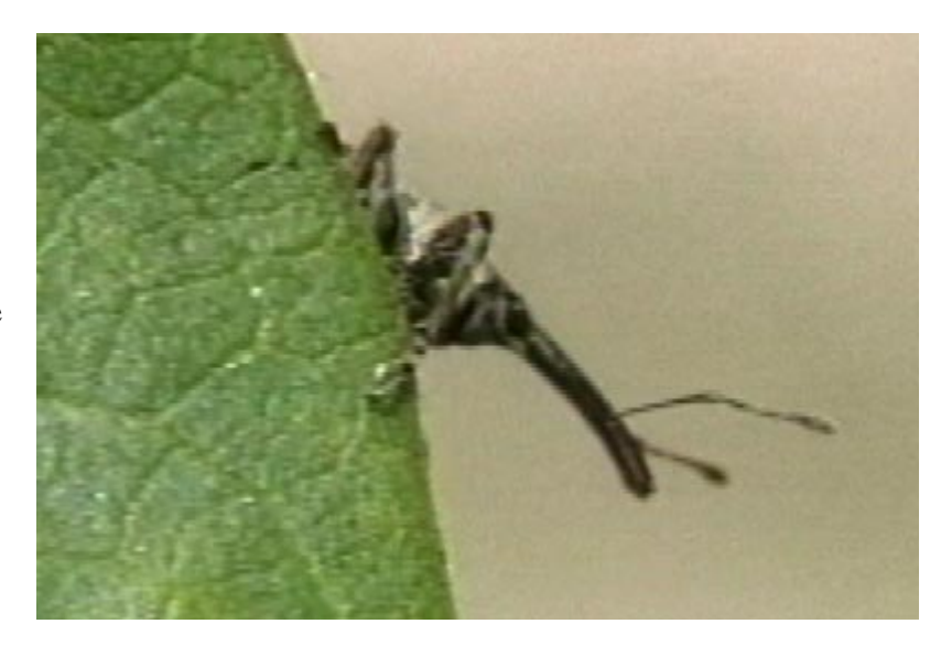
The NCC's Boll Weevil Action Committee was informed by USDA-APHIS that the boll weevil has been eradicated from 97 percent of U.S. cotton acreage.

The NCC submitted comments to EPA regarding the agency's draft Ecological