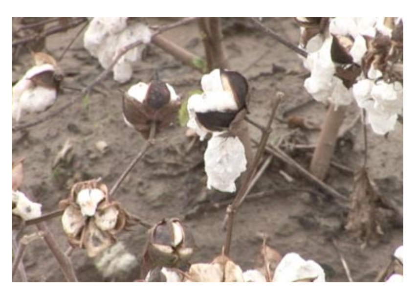
The NCC, in conjunction with the NCGA, developed "Recommendations For Handling Seed Cotton Exposed To Excessive Rainfall," which was made available on the NCC's website.