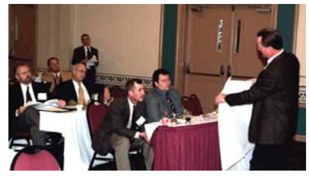
The Joint Cotton Industry Bale Packaging Committee's warehouse members inspect experimental bagging at the JCIBPC's 2003 meeting in Memphis, TN.

about the importance of using only USDA-approved bale packaging materials, which includes bags with the required identification markings. With a goal to ensure that all approved materials meet the industry's current packaging needs, the Joint Cotton Industry Bale Packaging Committee studied its specifications review process, especially the way existing specifications might be modified. The JCIBPC also approved a new automatic wire tying system for cotton bales to support its goal of providing the industry automation alternatives.