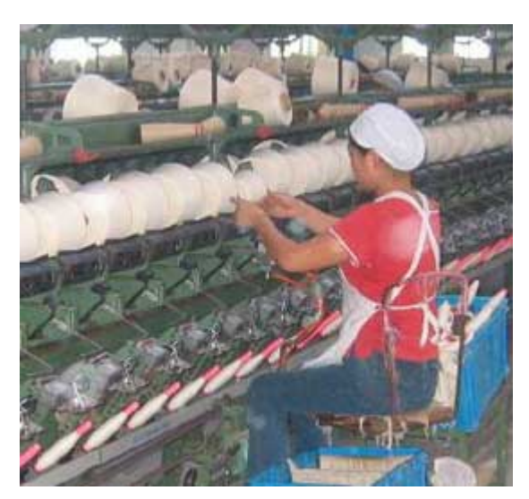
A U.S. cotton industry executive delegation visiting China learned much about that country's cotton production and growing textile sector, which has a capacity of 50 million spindles and 750,000 looms.

Throughout the year, the NCC and its textile coalition partners expressed apprehension over China's taking advantage of ascension to the WTO to flood the U.S. with textile imports. The NCC also helped arrange and participated in orientations with senior textile executives in North Carolina, South Carolina and New York – which resulted in voter registrations and heightened communications with Congressional delegations and the