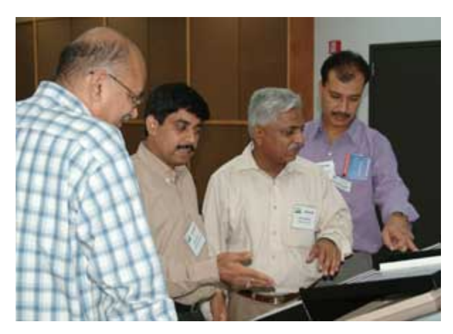
CCI hosted a COTTON USA special trade mission from India, which has become the ninth largest export market for upland cotton fiber

capabilities, production costs and support mechanisms to assist the United States in the Free Trade Agreement of the Americas negotiations.