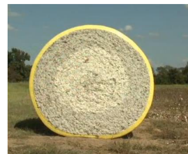
Figure 1. Ring of wet cotton is evident on the outer area of a module harvested after rainfall began.

The new cotton harvesters from John Deere (CP690; CS690) can provide a real time estimate of seed cotton moisture content. For traditional cotton modules, seed cotton moisture content above 12% wet basis will result in loss of color grades, and higher moisture contents can risk complete loss of the cotton due to overheating (Curley et al., 1987). Current studies of both picked and stripped cotton stored in round modules indicate this threshold still applies to the new round module harvest systems (van De Sluijs and Long, 2015; Faulkner et al., 2016). There is also evidence that round modules are generally better at preventing moisture from entering seed cotton, and they will also retain moisture if the cotton is harvested too wet (Byler et al, 2009). Furthermore, round modules are much less forgiving of trying to finish a field during a rain as there is limited mixing of the cotton (see example in Figure 1). The objective of this brochure is to remind producers of the importance of harvesting cotton at proper moisture content and what the potential costs are if they do not. Determining when it is safe to harvest if a moisture meter is not available is also discussed.