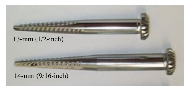
Figure 1. Picker spindles used in the study.

Figure 1 shows the 13- and 14-mm (1/2- and 9/16-in) diameter spindles used in the experiment. The 13-mm spindle, the most common size, has a shorter extension into the plant, and weighs less than the 14-mm spindle resulting in a lighter picker head. As reported by Armijo et al. (2006b), it is believed that because the 14-mm spindle extends further into the plant, the longer spindle may do less plant damage during picking since the cotton plant is not compressed as much due to a wider picking zone. The wider picking zone may lead to less trash in the seed cotton. The 13-mm spindle had 4.9 cm (1.9 in) of the spindle tip extending into the picking zone, whereas the 14-mm spindle had 6.1 cm (2.4 in) of the spindle tip extending into the picking zone. With the 13-mm spindle, the cotton plant is compressed through a picking zone that is 1.2 cm (0.5 in) narrower.