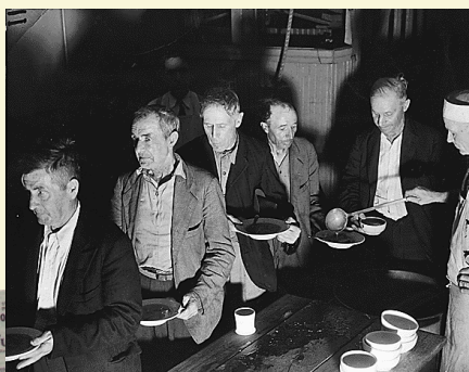
Soup lines and food rations were a reality in the 1930s and 1940s.

U.S. farm policy critics often point to an abundance of food and fiber and say, "never to worry." Likewise, a December 1945 article of The American Political Science Review noted that, prior to Pearl Harbor, few Americans gave serious thought to food shortages and rationing. But, 16 months later, the United States government began rationing sugar, processed foods, meats, and cheese. That was just 61 years ago. While a lot has changed since then, including methods of producing food and fighting war, the unforeseen can happen and the U.S. should always be prepared with ample supplies of safe food and farmers who know how to produce it.