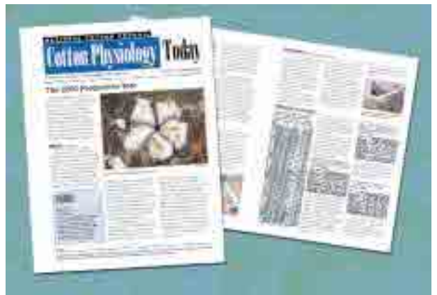
The Cotton Physiology Today newsletter shares leading physiologists' insights on topics ranging from variety selection to defoliation timing.

This program's mission is to discover and communicate more profitable methods of producing cotton. A key program element is Cotton Physiology Today , a newsletter that provides in-depth discussion of technical and production issues as the cotton growing season progresses. The newsletters are produced by the NCC in collaboration with veteran cotton physiologists. The newsletters contain proven strategies to help growers manage practices ranging from fertilization to harvest timing.