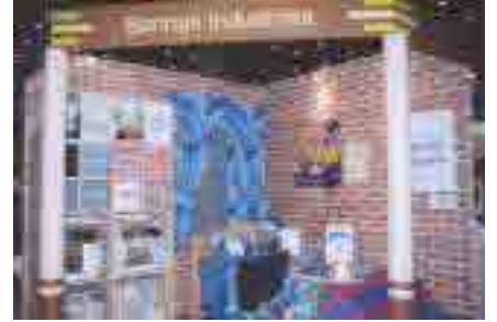
U.S. textile manufacturers received product exposure at company booths in the Japantex 2001 U.S. cotton pavilion.

This enables CCI to develop markets for U.S. cotton fiber and manufactured cotton products – a critical activity to improving the U.S. cotton industry’s competitiveness. Exports of U.S. cotton and cotton products help retain U.S. jobs on and off the farm, maintain the U.S. farm and textile sector’s profitability and improve the U.S. trade balance.