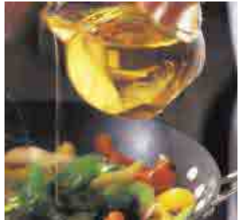
A two percent increase in cottonseed's oil content would mean an increase in seed value of $10 per ton.

Other project contributors include: the Southern Cotton Ginners Foundation (SCGF), the Texas Food and Fibers Commission and Cotton Incorporated.