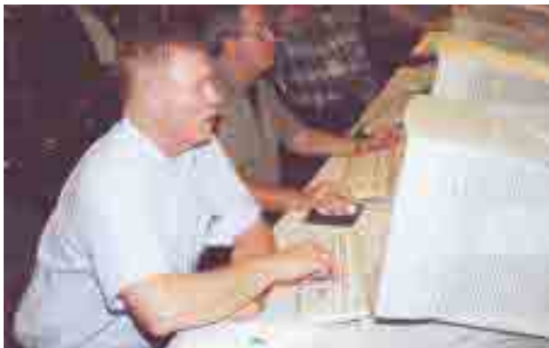
Attendees at the 2001 Beltwide Cotton Conferences were able to navigate the NCC web site and learn about features to be included in the site's spring 2001 redesign.

This project also assumed duties related to the NCC's weather site.