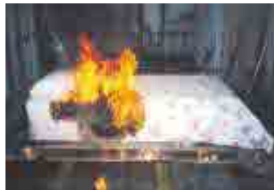
A new method for open flame testing of mattresses is being developed by the National Institute of Science and Technology.

Some funds are kept available as emergency support for high priority projects that may not be anticipated during the normal cycle of project planning. In 2000, efforts supported by contingency included providing seed money for initiating investigations into pathological causes of bronze wilt. Support allowed researchers at the University of Arkansas, Clemson University and the USDA/ARS Cotton Pathology Laboratory to begin work for "Clarification of the Role of Agrobacterium species in Bronze Wilt of Cotton."