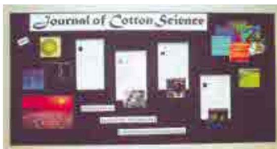
The on-line Journal of Cotton Science has received more than 200 manuscripts for peer review.

By doing so, JCS gives producers, researchers, Extension personnel, crop consultants and others a central, easily accessible base of proven research findings in disciplines ranging from agronomy to textile processing. To date, JCS has received 212 manuscripts for peer review. Of those, 107 have been accepted, published online and archived on CD-ROM.