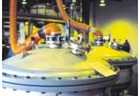
A manufacturing process for commercial production of atoxigenic strains of aflatoxin is being refined.