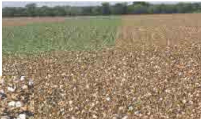
Chemical defoliation and other studies were conducted along with variety testing at six locations in Kansas.

six locations. In addition, a research gin was purchased – a move that has reduced the amount of time and expenses associated with processing research and demonstration samples and getting the data into Kansas producers' hands.